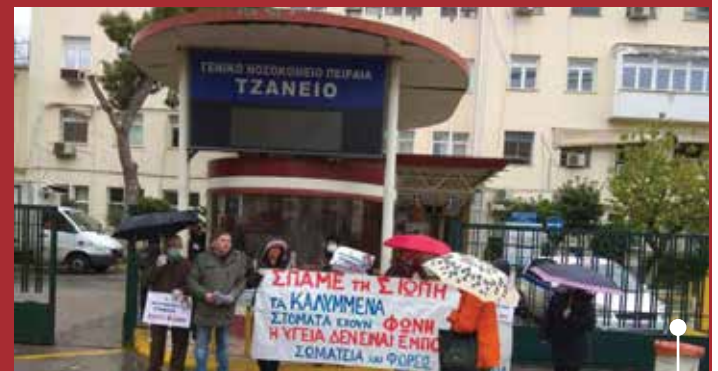
hospital of Tzaneio