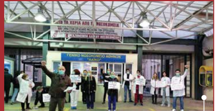
hospital of Laiko