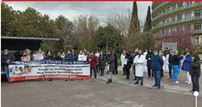
hospital of Kat