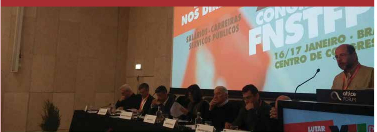
PAME at the Conference of the Federation of Public Service in Portugal