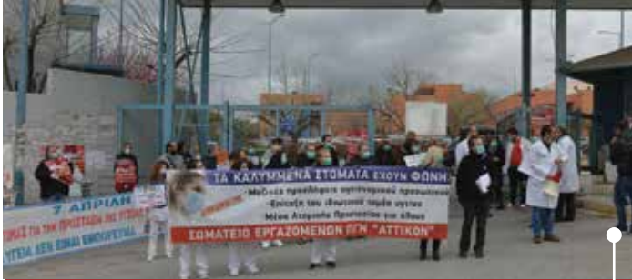
hospital of Attiko

Hospital doctors and class unions held a series of mobilizations and actions, demanding that the government take effective measures to protect workers and the people from the pandemic. Thousands of workers responded to hospital doctors' call, joined forces with them.