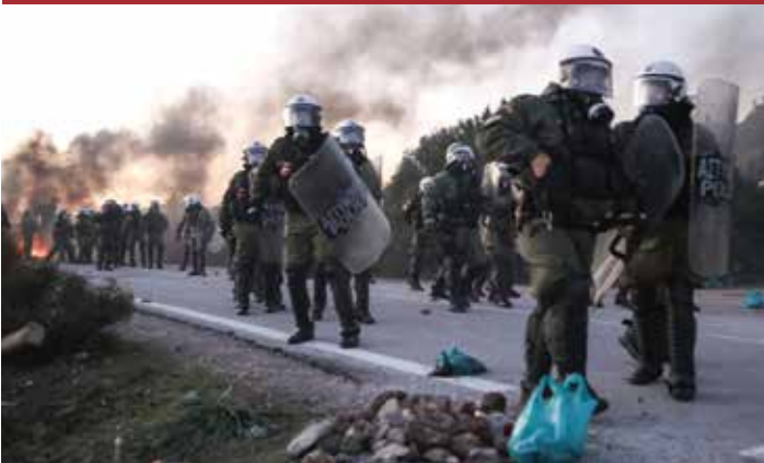
25/02 Demonstrations of Lesbos Regional Trade Union against the governmental attempt to turn Greek islands into prisons for refugees and the constant presence of repression forces