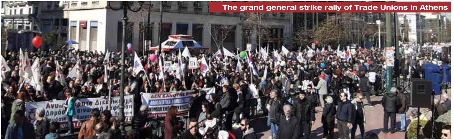
The grand general strike rally of Trade Unions in Athens

The class-oriented trade unions have taken the lead, organizing strikes and rallies on the 18th of February, in a series of Greek cities and towns. The strike came as a result of mass procedures and General Assemblies of Trade Unions and regional Trade Unions throughout the country, as the majority of the General Union of Greek Workers (GSEE) has once again proven its pro-employer role, having refused to declare a general strike, in front of the total dissolution of the Public Insurance.