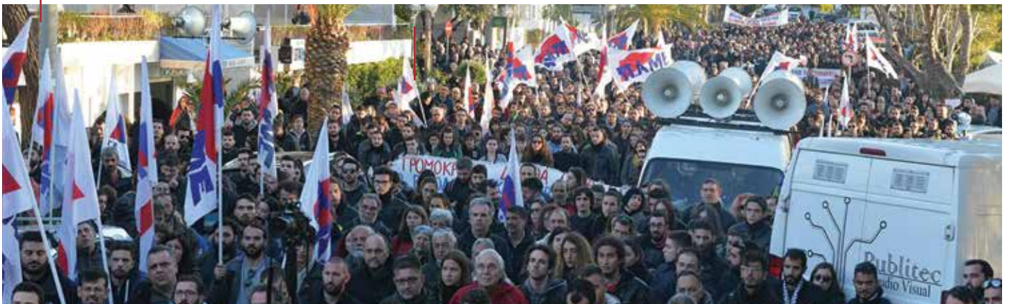
Until late in the afternoon, the class unions protested