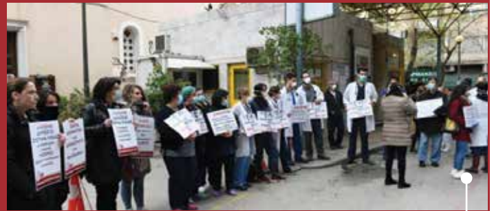
hospital of Evaggelismos