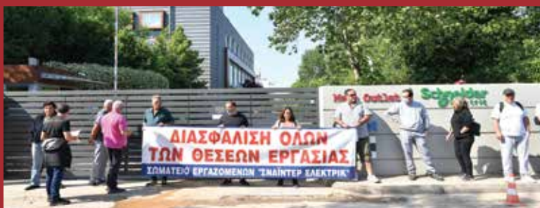
25/05 Mobilization of Schneider Electric workers against the closure of the factory