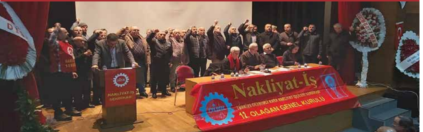
PAME at the Nakliyat-İs Conference in Turkey