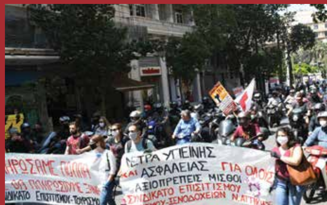
28/04 Moto-demonstration organized by the Trade Union of Workers in Tourism-Hotels