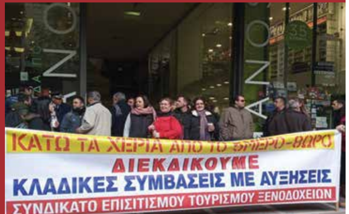
07/02 Protest of the Trade Union of Workers in Hotels-Tourism for Collective contracts