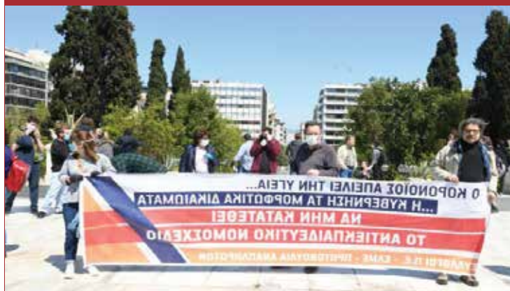
24/04 Demonstration of students and teachers against the governmental bill for state Education