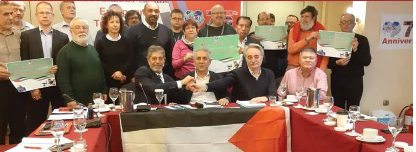
PAME at the meeting of European Trade Unions of WFTU