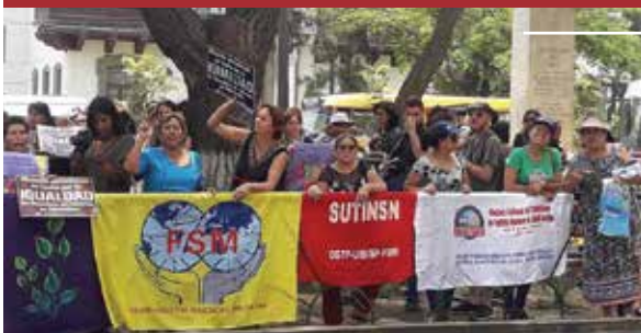
WFTU honoring the International Working Woman Day