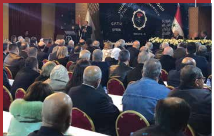
Foundation Congress of the WFTU TUI in Textile, Clothing, Leather