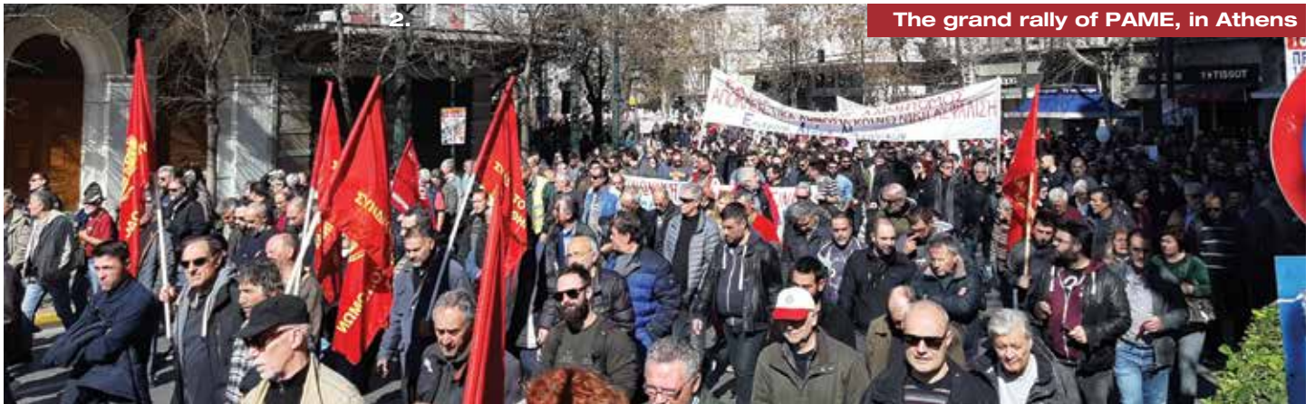
The grand rally of PAME, in Athens

With the flags and banners of their trade unions, the workers demonstrate for Total, Mandatory and Public Social Insurance