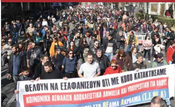
Strike rally in Thessaloniki

With the flags and banners of their trade unions, the workers demonstrate for Total, Mandatory and Public Social Insurance