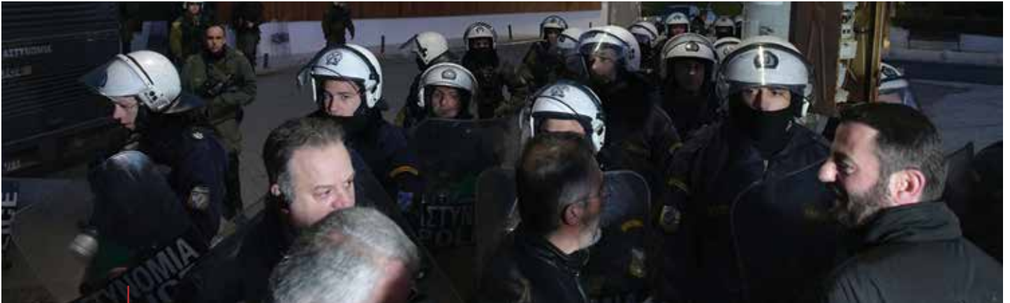
The repressive forces protected the majority in the GSEE leadership from class-oriented unions and protesting workers