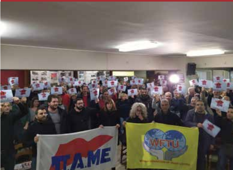
PAME's solidarity with the workers of France