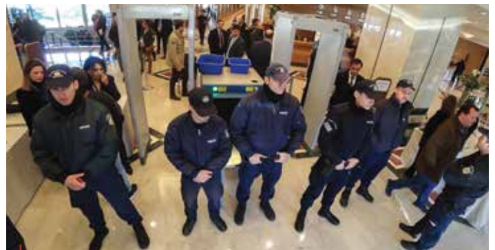
In the area where the Congress is held, the police conducted face-control and checks on the delegates