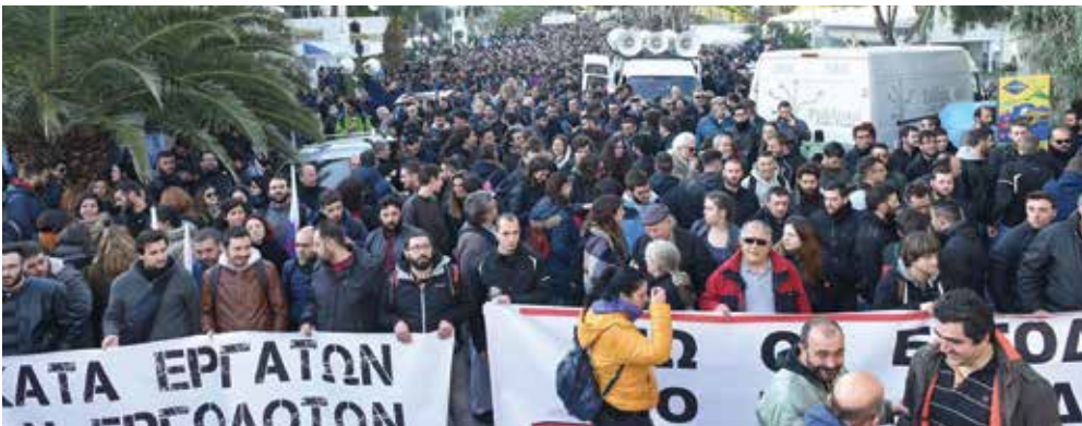
The large rally of the unions in the area of the Congress