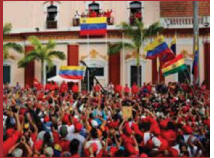
Message of solidarity of PAME to the people of Venezuela