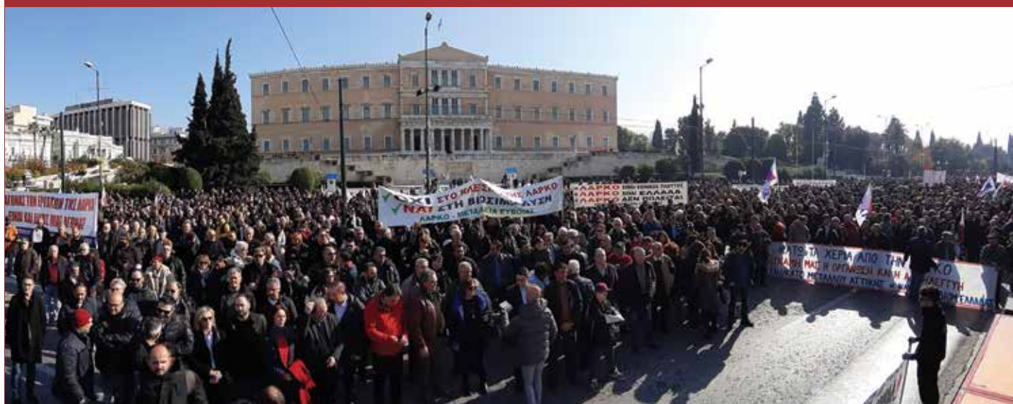
25/01 Mobilization against the privatization of LARCO (General Mining and Metallurgic Company).