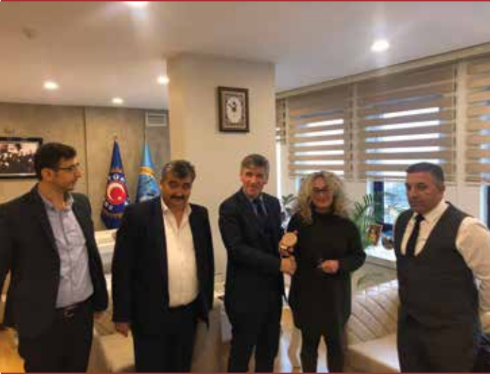
Meeting of the Federation of Workers in Pharmaceuticals with the Petrol-İs trade union in Turkey