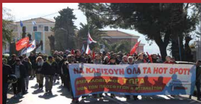
22/01 Rally organized by Lesbos Regional Trade Union