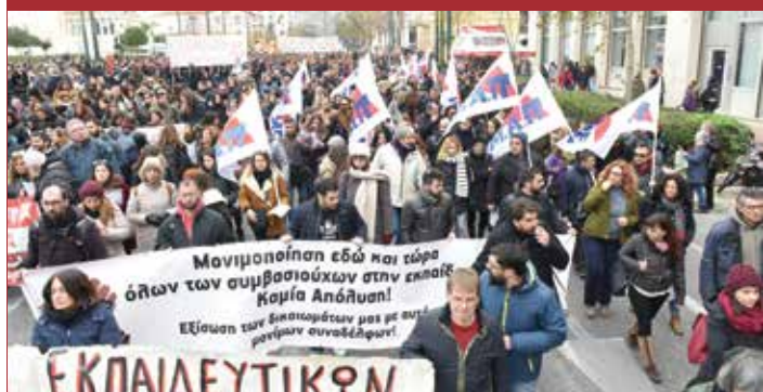
21/01 Demonstration of students and teachers against the governmental bill for University Education