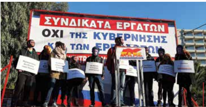
Humorous theatrical sketch that satirizes the “monkeys” -illegitimate representatives at the GSEE Congress