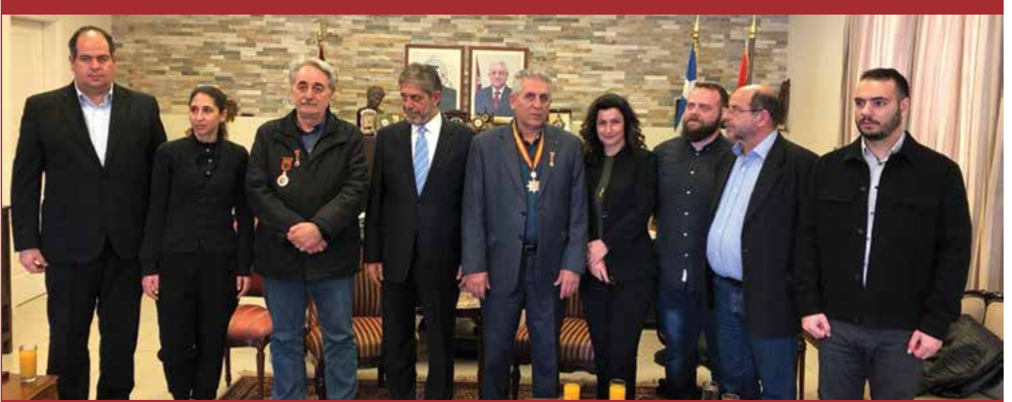
Award for PAME and WFTU by the Ambassador of Palestine for their contribution to solidarity and action for the struggle of the Palestinian people