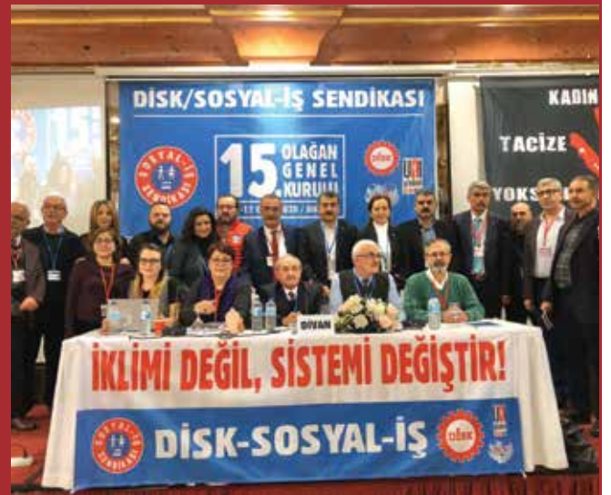
PAME at the Sosyal-Is Conference in Turkey