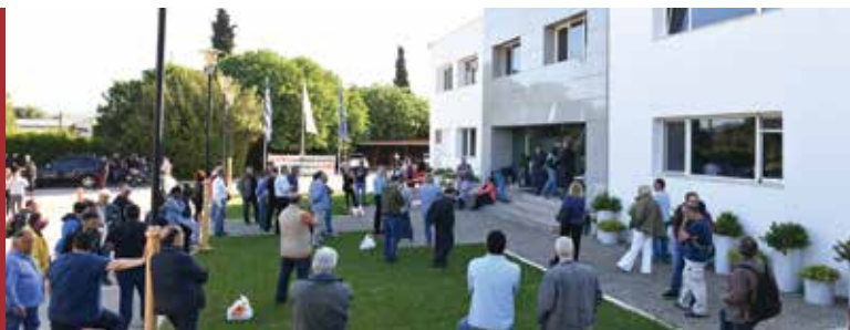
13/05 Symbolic occupation of LARCO employees at the company's offices in Athens