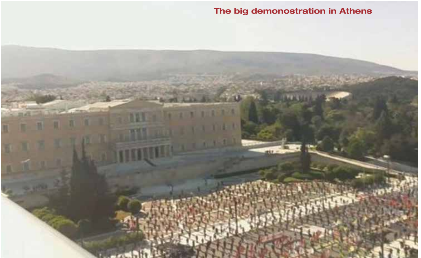
The big demonstration in Athens

They are not invincible! They are not invincible in the face of the organized power of the people! Law is the right of the worker! Long live International Workers Day, a day of struggle of workers around the world!