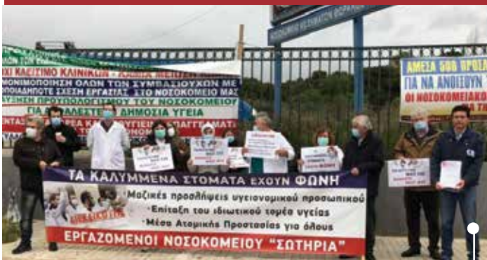
hospital of Sotiria