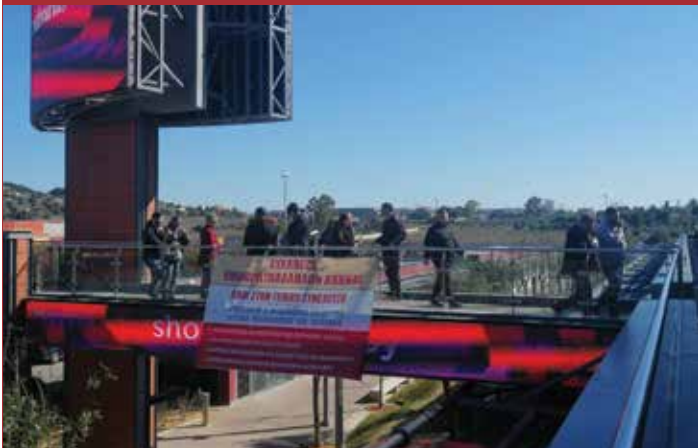
01/2 Intervention of Athens Trade Union of workers in Commerce against the abolition of Sunday as a day off