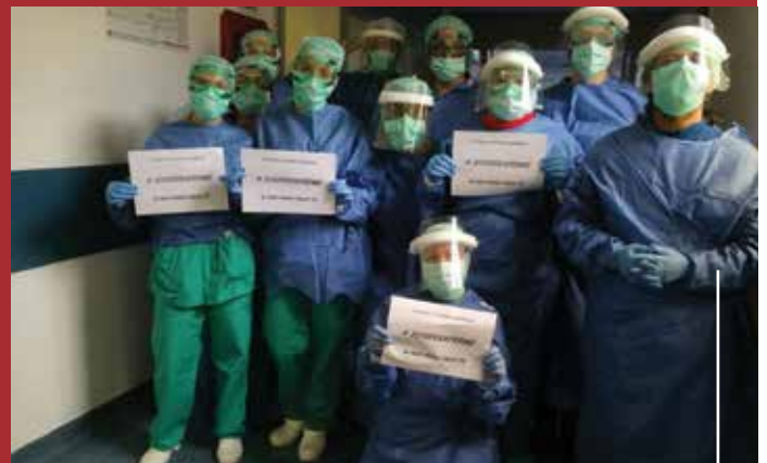
march 25, strike of USB in Italy