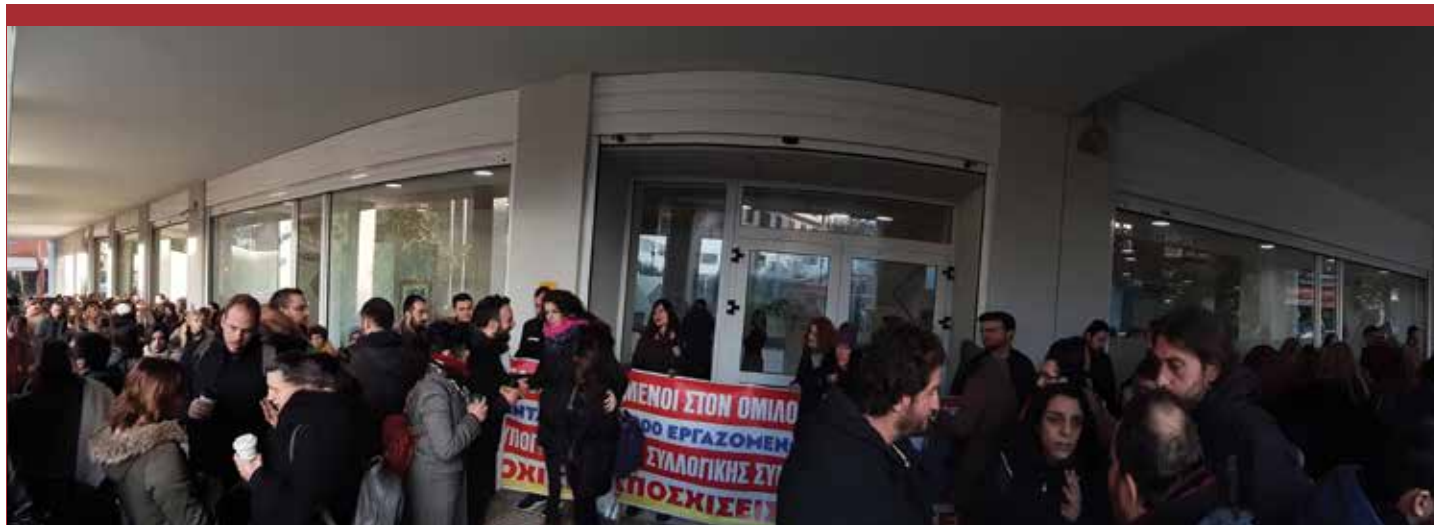
20 days strike of workers at OTE-Deutsche Telekom demanding collective contract