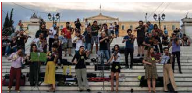
07/05 Mobilization of Workers in Arts for the protection and assertion of their working rights