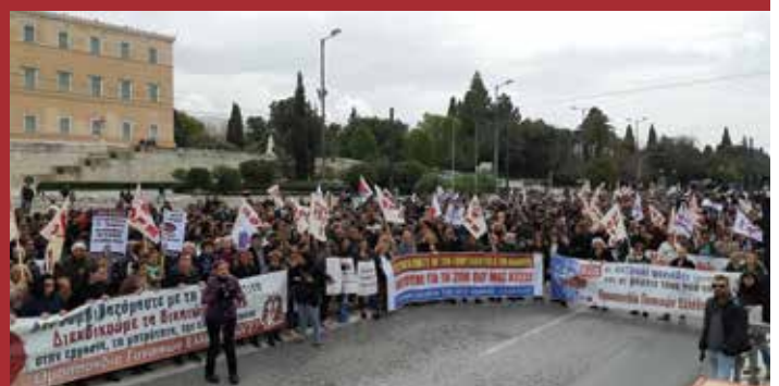
08/03 demonstration for the International Day of Working Women