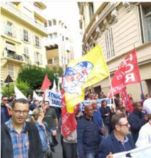
Wftu delegation on strike in Monaco