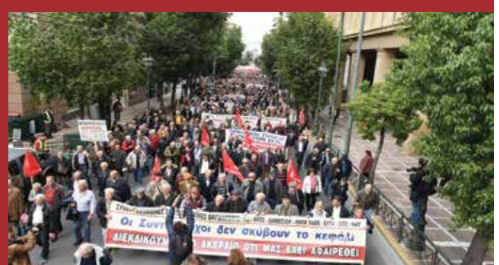
27/03. Demonstration of Pensioners against the cuts in pensions