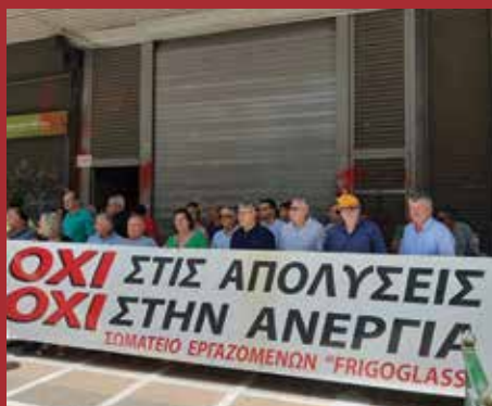
13/06. Demonstration of the workers in Frigoglass against the layoffs.