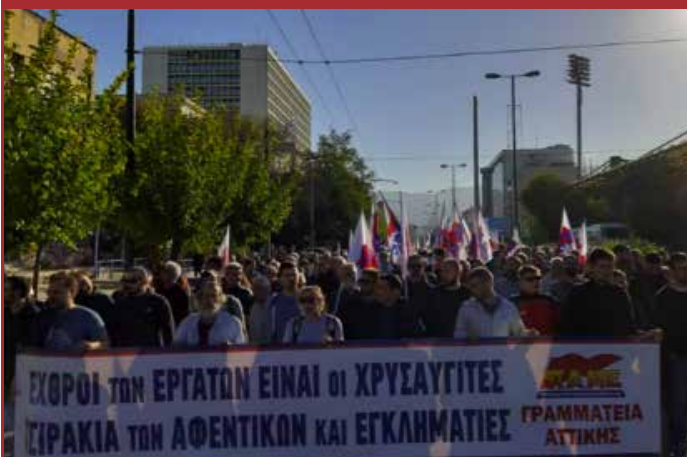
06/11, mobilization of trade unions to condemn the criminal, Nazi Golden Dawn