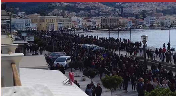
07/02. Strike of the Regional Trade Union of Samos demanding to close the HotSpots and stop refugee enclosure