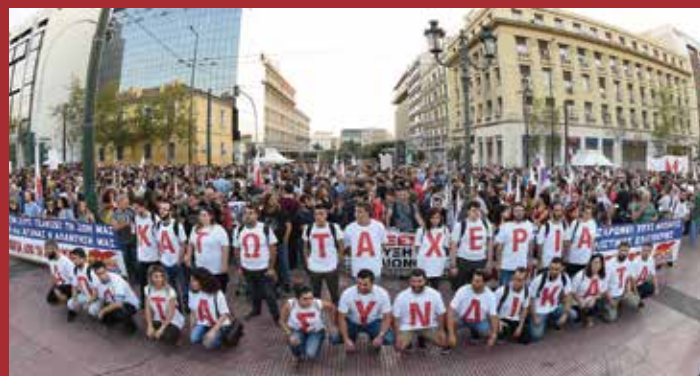
11/09 rally of class trade unions and federations in Athens against the abolition of Sectoral Collective Agreements and the intervention of the state in the trade unions