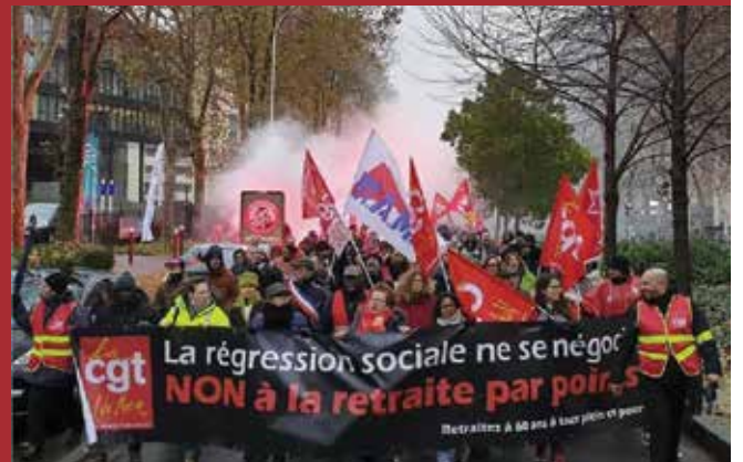
PAME at strike rallies in France expressing solidarity with Greek workers