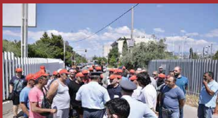
25/07. Demonstration of the workers in "SIDENOR" for collective agreement