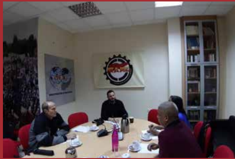
Meeting of the Textile, Clothing, Leather Federation with a delegation from the Bangladesh Textile Federation