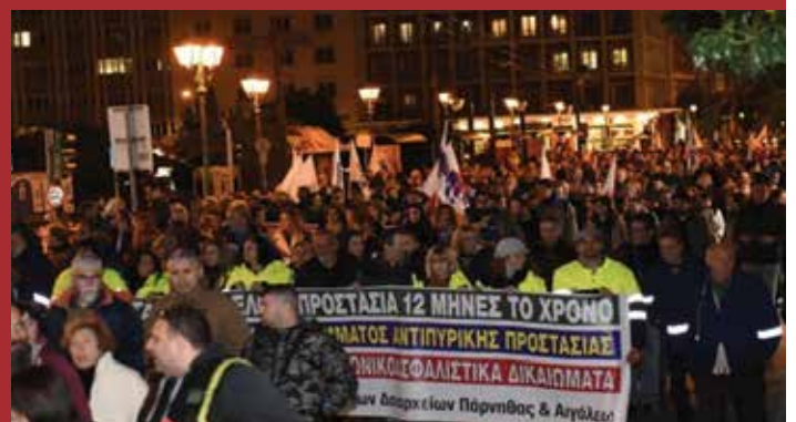
12/02. Demonstration of the Trade Unions in Public Sector