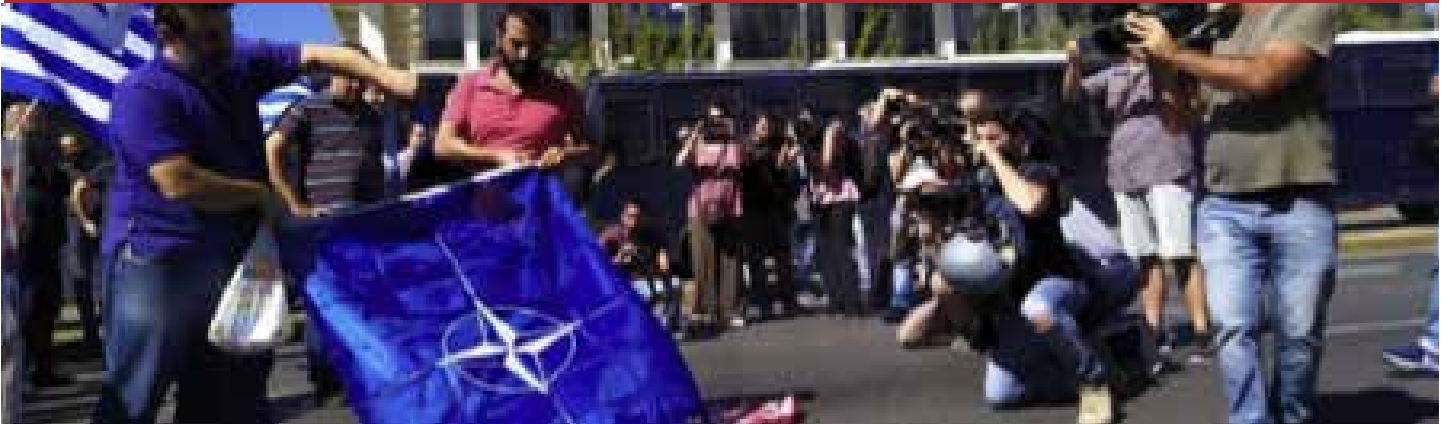
Outside of the US Embassy