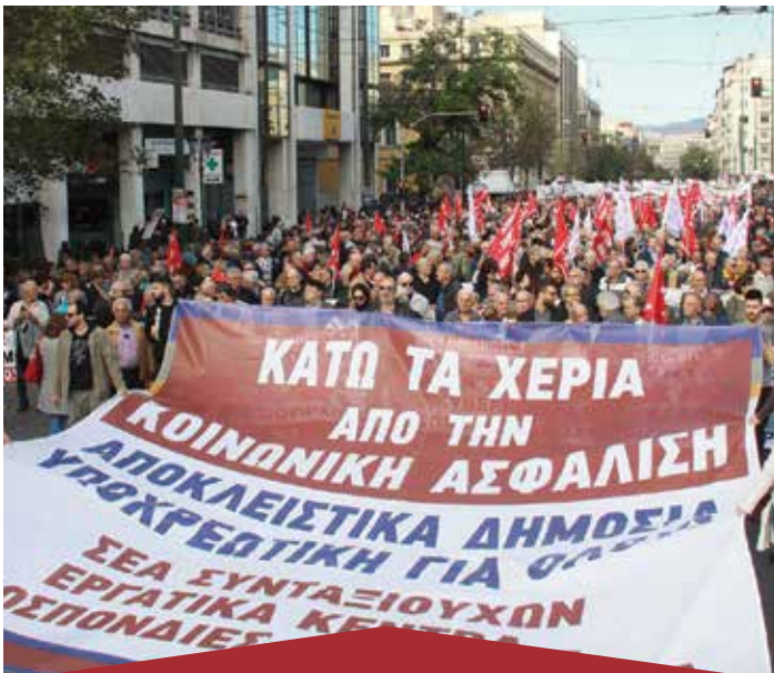
Rally for Social Security 30/11, Athens