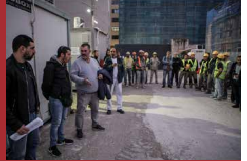
Marseille Workers' Delegation Tour at Papastratos Construction Site with Athens Builders Trade Union