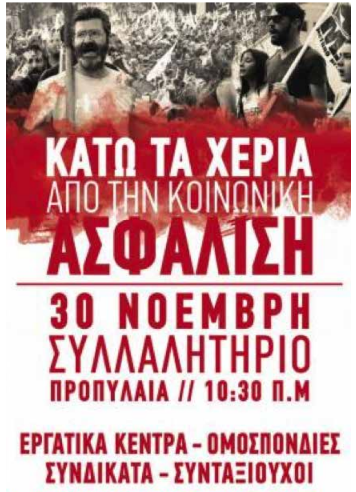
Poster of the Trade Unions, Federations and Worker Centers for the rally on 30/11