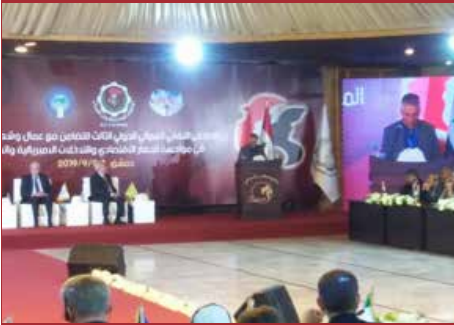
PAME solidarity with the Syrian people at an event in Damascus at the invitation of the General Union of Syrian Workers