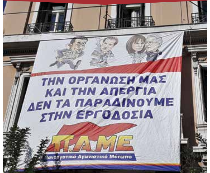
From the strike on 02/10 in Athens