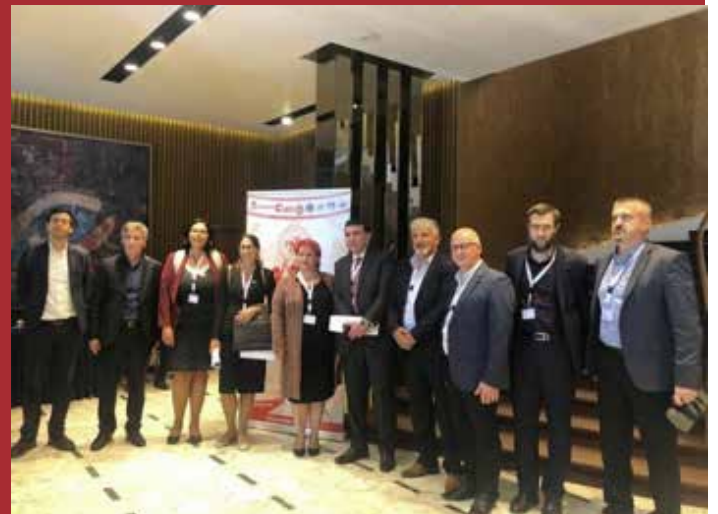
PAME delegation at the Conference of the Federation of Industrial Workers of Albania