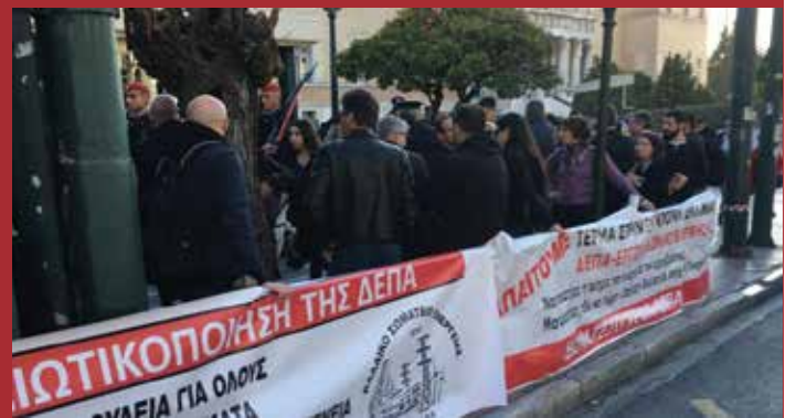
08/05, Strike of the workers in Gas company against the privatization and the hitting of their rights.