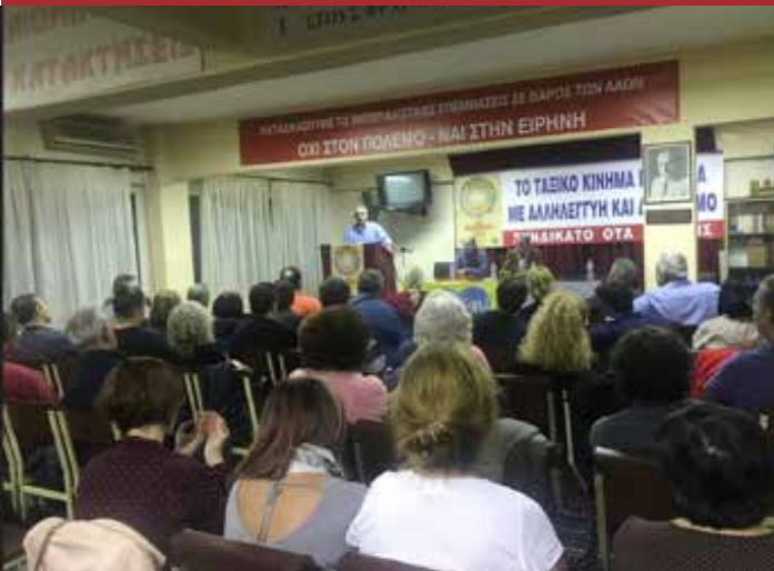
Joint Event of the OTA- Municipality Workers Trade Union with the WFTU Against the Imperialist Wars