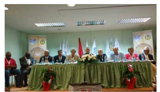
13th Sectoral Conference on Public Services of the WFTU In Cyprus