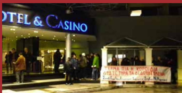
26/09 Mobilization of the Casino employees asking to be paid