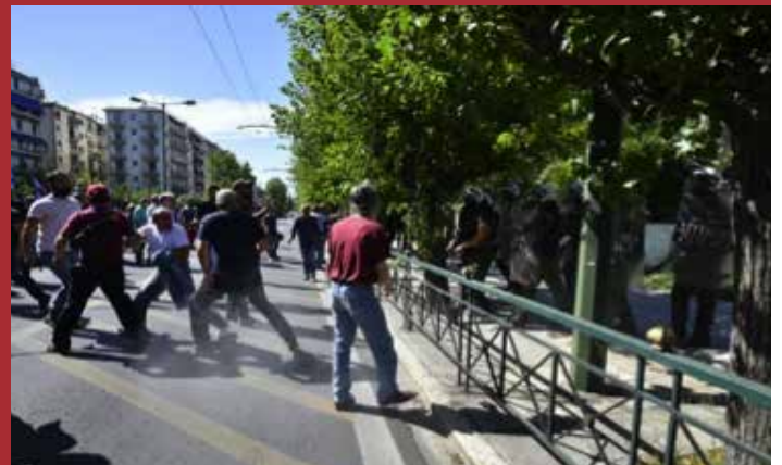
Government responds with repression and violence