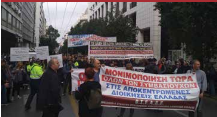
20/11 Mobilization of forest workers demanding permanent and stable work for everyone