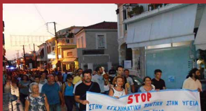
27/08. Demonstration of the Regional Trade Union of Samos and Workers in Hospital for Health.