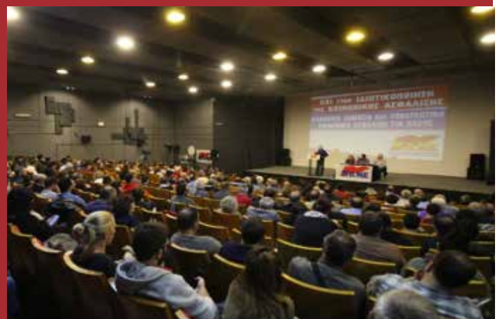
11/11 meeting of trade unions, Federations and worker's Centers Against Social Security Bill