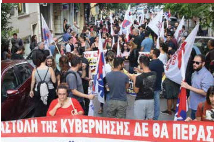
2/10, trade union intervention against house auctions