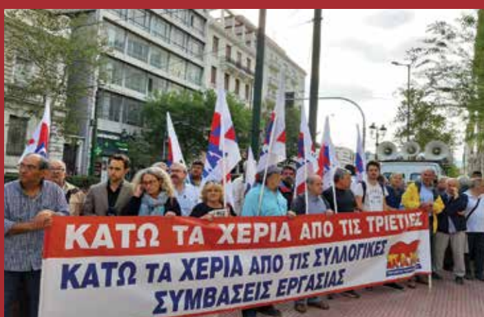
04/10 Mobilization of class trade unions for Collective Contracts