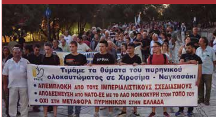
06/08. Anti-Imperialist Event In Honor Of The Victims In Hiroshima-Nagasaki from class oriented Trade Unions