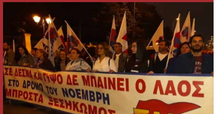
17/11 PAME in the celebration of the Polytechnic uprising