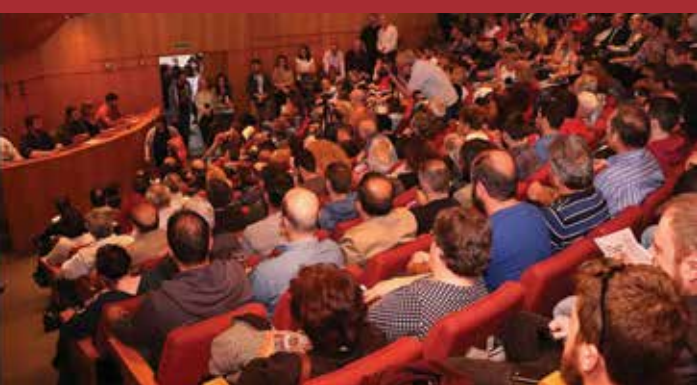
07/05. Trade Union Conference For The Evaluation Of The Action of the Unions And The Organization Of The Next Initiatives