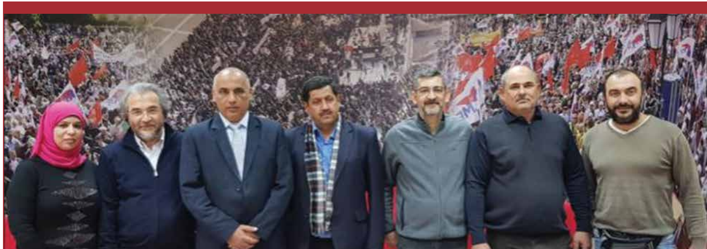
Meeting of PAME with the General Union of Palestinian Workers