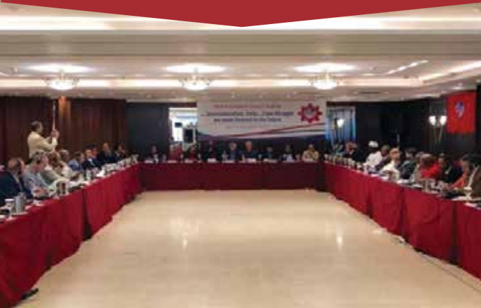
From the first day of the opening of the Presidential Council of WFTU