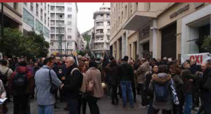
04/12 Demonstration of bank employees against dismissals