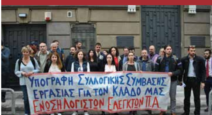
07/03. Demonstration of the National Federation of the Accountants for Collective Agreement