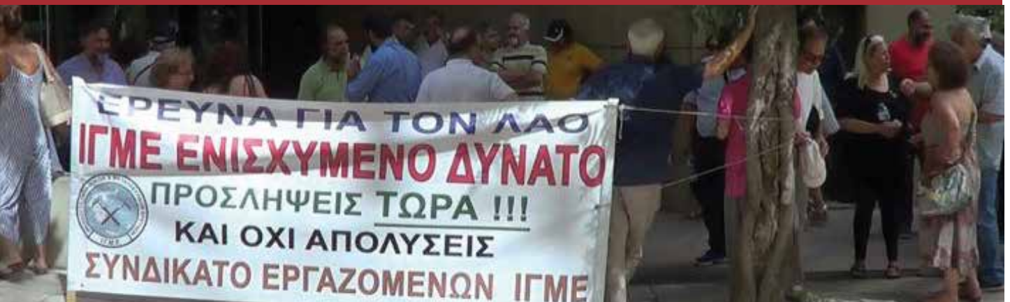
10/05. Demonstration of the Trade Union of the Workers in the Hellenic Survey of Geology and Mineral Exploration (IGME) for the delayed salaries