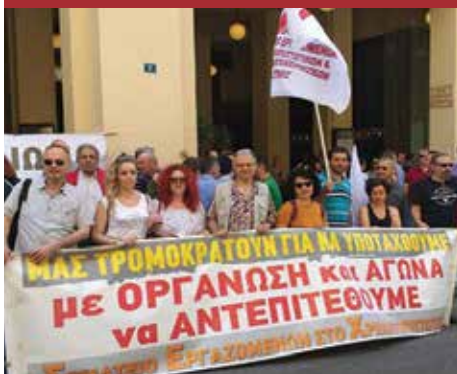
03/06. Strike of the workers in Piraeus Bank

Strikes of Workers' Unions and Federations for Collective Contracts.