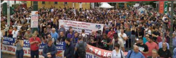
World Day of Action of the WFTU against xenophobia, racism and fascism. The banner at the PAME strike on 02/10