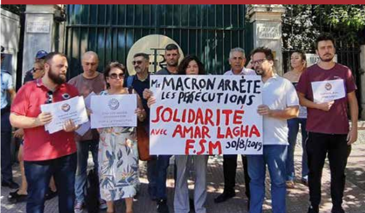
Intervention of PAME at the Embassy of France for the prosecution of the General Secretary of the Federation of Trade of France.