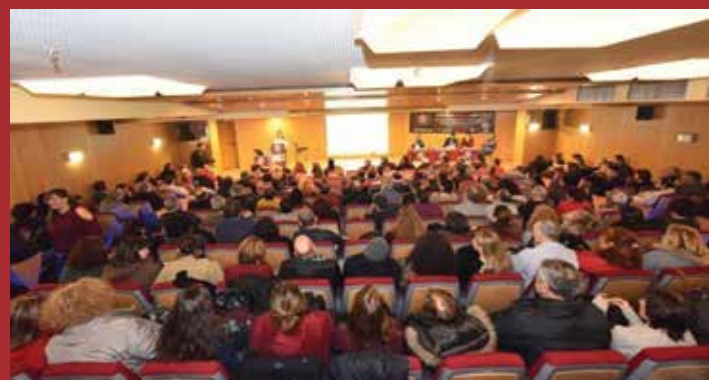
17/01. Workshop of the Trade Union of Workers in Municipalities for health and safety in Work