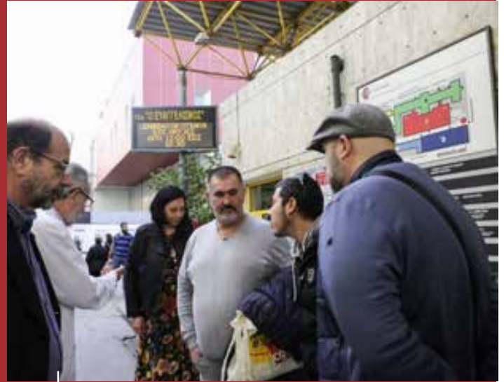
Meeting of Marseille Workers' Delegation with the Evangelismos Hospital Workers' Union