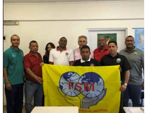
Panama's FUCLAT Food Federation delegation visits Wftu headquarters in Athens