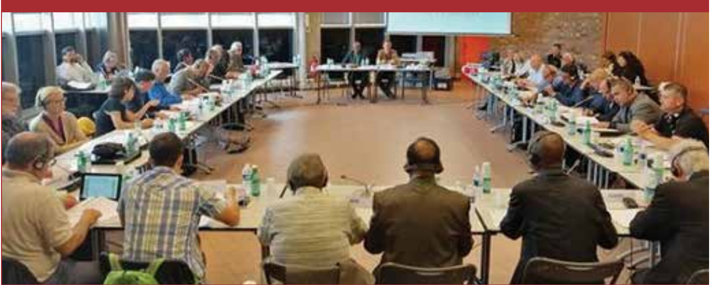
Delegation of PAME at the Meeting of TUI Agroalimentary of WFTU