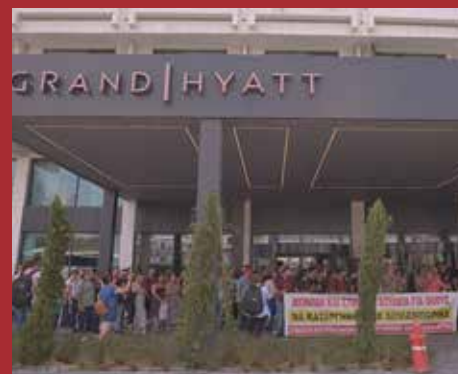
19/06. Strike of the Workers in Tourism Sector