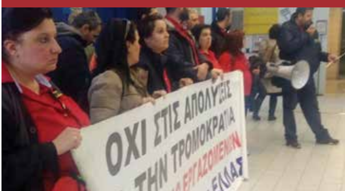
01/04. Demonstration of the Trade Union of Workers in Praktiker against the lay offs.