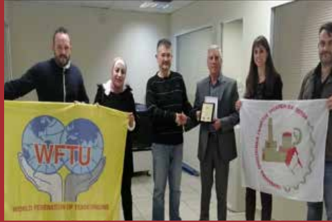
Meeting of the Food and Beverage Milk Federation of Greece with the Food Federation of Jordan