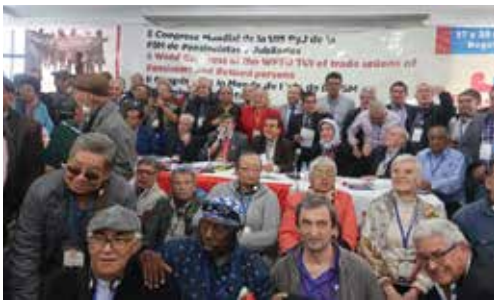
14th Congress of TUI Transport, Communication and Fisheries of WFTU in Turkey