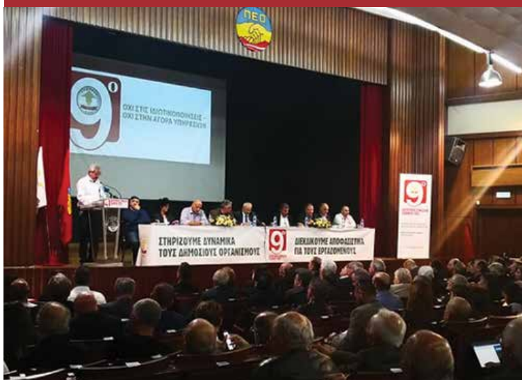
Delegation of PAME at the 9th Congress of SIDIKEK PEO of Cyprus