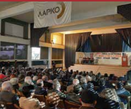
05/12 meeting of trade unions and workers on Larko