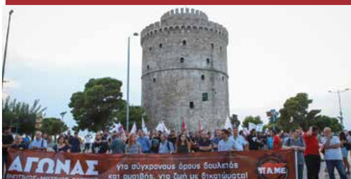
07/09 Large PAME rally in Thessaloniki against announcements of ND government measures