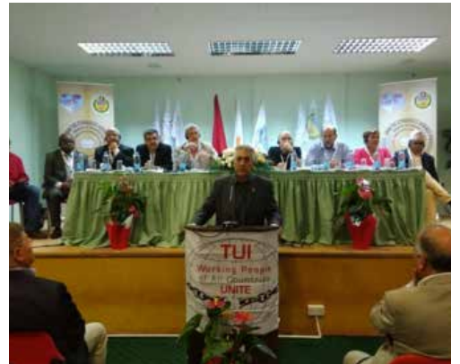
International WFTU Congress in Cyprus