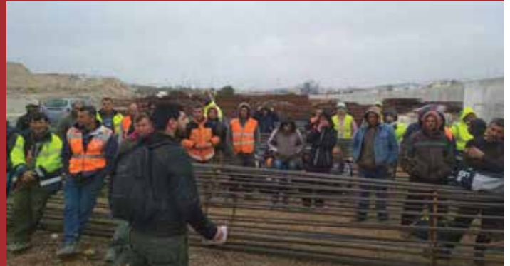
19/04. Strike of the Trade Union of Construction Workers at the construction site of Phaliro renovation against the unacceptable working conditions