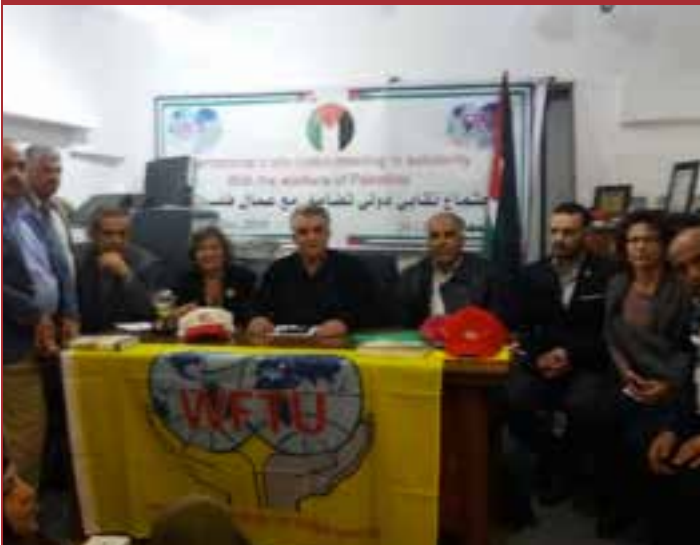
PAME mission in Palestine