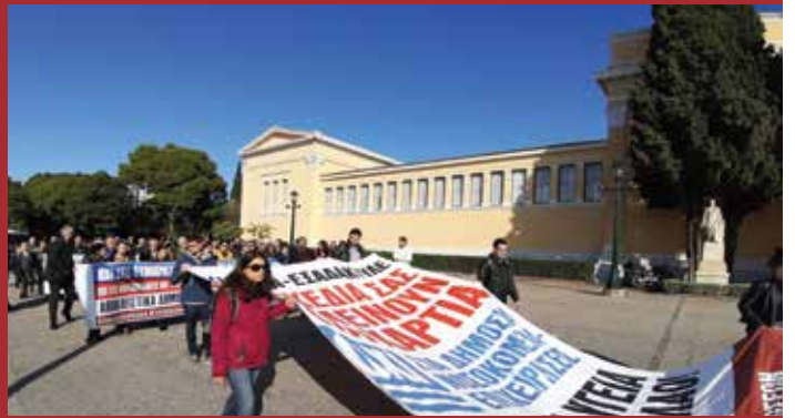
11/12 Mobilization of Health Workers Against Privatization