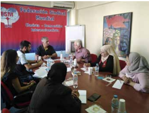
Meeting with a delegation of the Palestinian Trade Union Federation in Athens