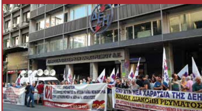
03/09 Mobilization of class trade unions against the privatization of Power Public Company