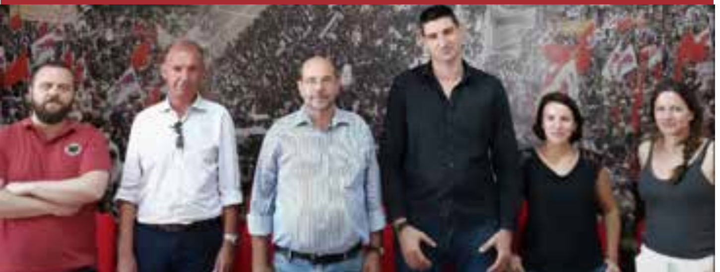
PAME meeting with the Val de Marne Labor Center in Athens