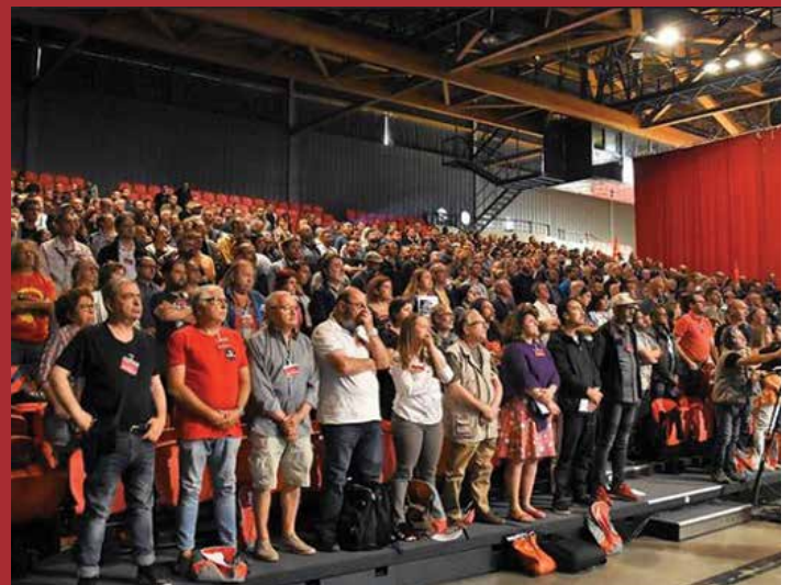
Delegation of PAME at the Congress of Regional Union of Marseille