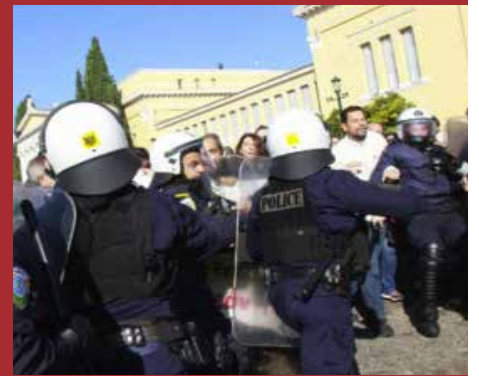
The rally was hit by the forces of repression