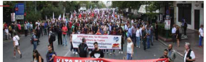
PAME Giant banner Outside GSEE Offices for Strike on 02/10