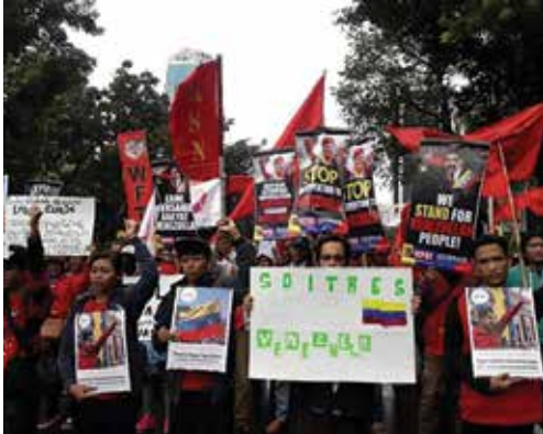
Hundreds trade unions are responding to the call of WFTU for solidarity to the people of Venezuela