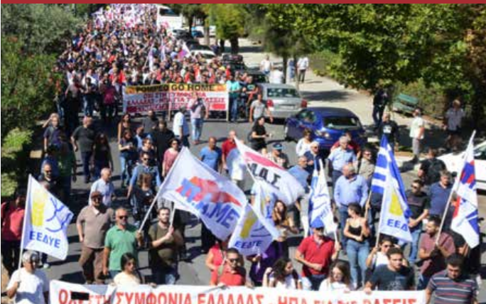
5/10 Mutual Defense Cooperation Agreement