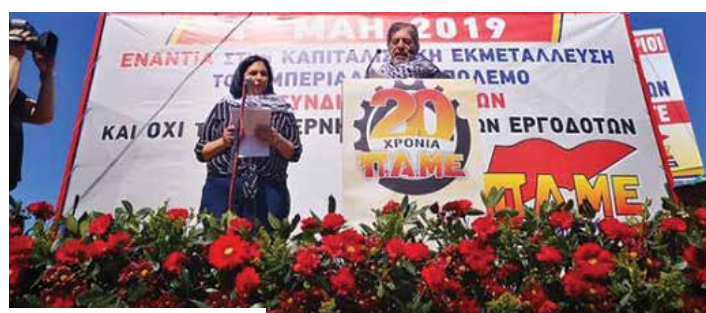
PAME's rally of 1st May in Athens.