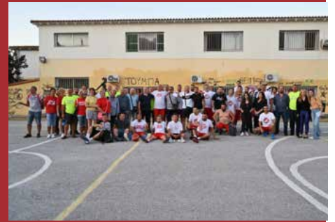
Basketball match between PAME and Serbia's SLOGA organization in the context of Balkan workers' friendship and solidarity initiatives