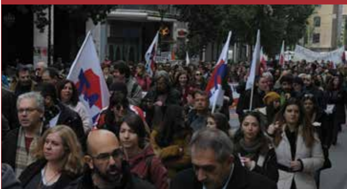
11/01 Teachers Demonstration demanding steady jobs and against the layoffs of the teachers and professor