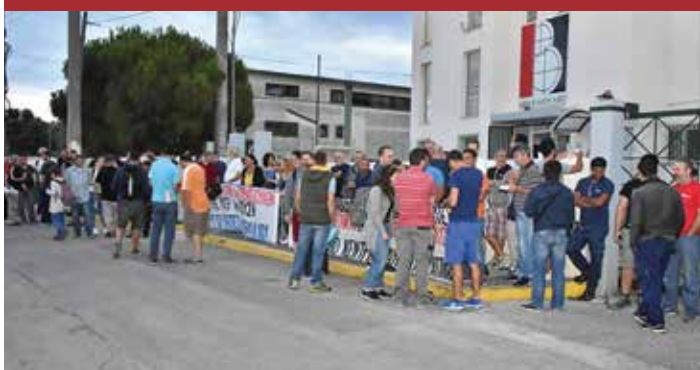
17/07. Strike of the workers in printing company "Vlachos Bros" against the layoff of the president of the Regional Trade Union of Lavrio.