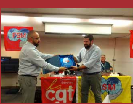
PAME delegation at the International Trade Union Of Commerce Workers Meeting in France