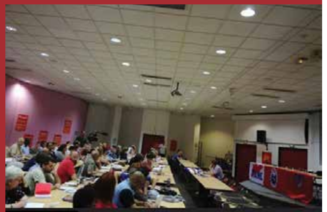
Delegation of PAME at the Congress of Regional Union of Marseille