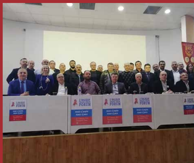
2nd Balkan Trade Union Forum in Thessaloniki