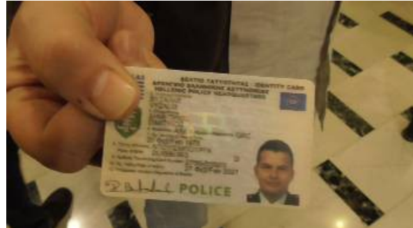
The police ID of the secret police agent

The meeting of the GSEE leadership with the government and the political leadership of the police a few days ago seems to have worked immediately and effectively. The SYRIZA-ANEL government has a huge responsibility for the presence and intervention of the police and the law enforcement forces in the workers' collective proceedings.