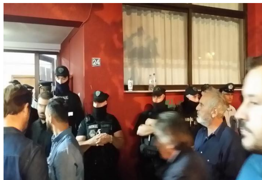
Riot Police and Police Forces "Ready for Action" outside the Congress of the Regional Trade Union of Katerini