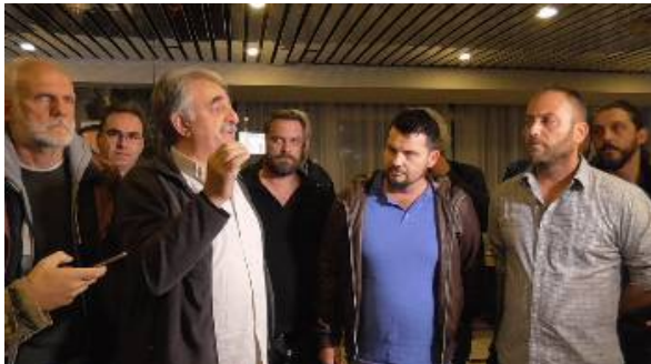
The police secret agent –second from right– caught inside the Congress room

On Thursday, November 8 at the opening of the Congress of the Regional Trade Union of Thessaloniki, the presence of the repression forces was upgraded with the involvement of a police director , who said he was invited by the leadership of the Thessaloniki Regional Trade Union, justifying that he was at the Congress "for any possible event". Later, a police secret service agent was caught by workers inside the Congress room.